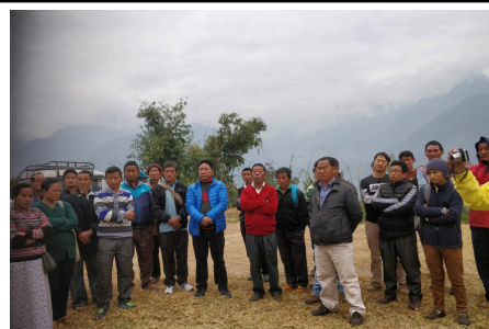
Social Impact Assessment and Evaluation Studies (LARR Implementation)