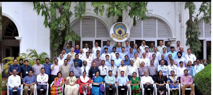
October 2019 89 Nominations