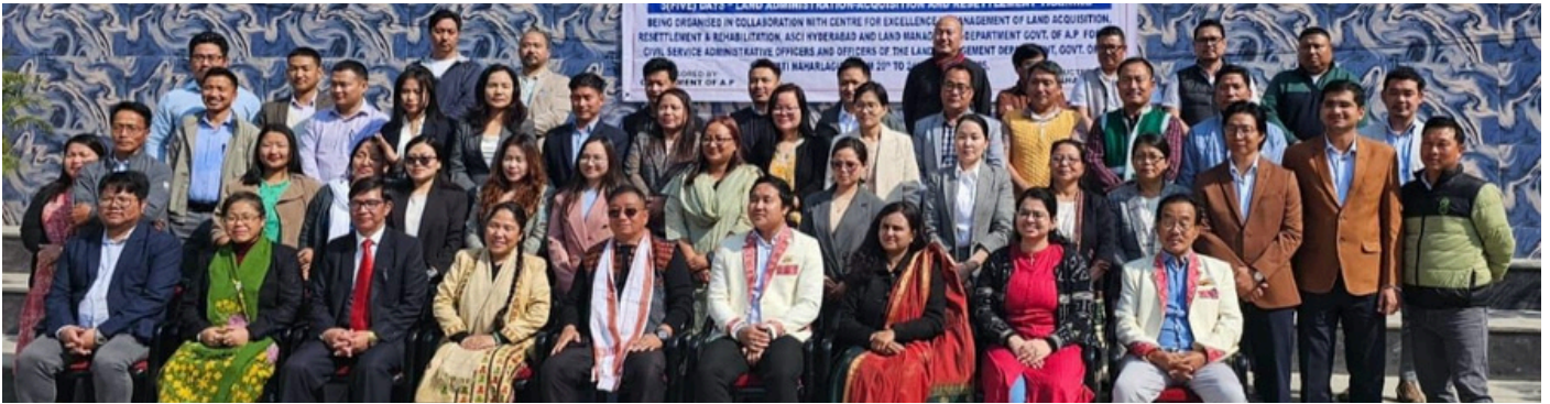
Land Administration - Acquisition and Resettlement Training, Arunachal Pradesh, January 2025