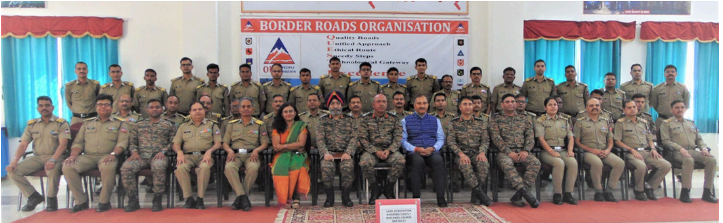
Participants of Land Acquisition Course for Border Roads Organisation January 2025

Land Acquisition laws and its interpretations are being done all over the country in a very haphazard manner. I feel it is only at CMLARR that it was presented in a form wherein we can put it across confidently now. It is now, we know its strengths as well the handicaps, justified in the most apt manner. It was a training organised at optimum level to full benefit.