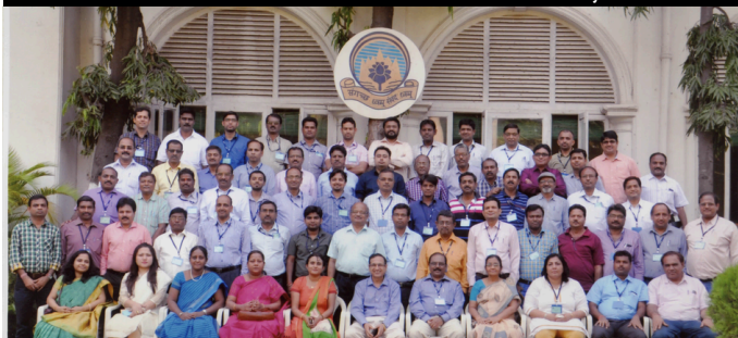
October 2015 75 Nominations