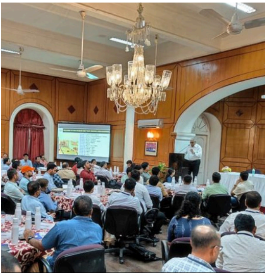
Chairman, ASCI CoG at the Inauguration of ASCI Announced course Avoiding Costly Mistakes in Land Acquisition and Resettlement, 2024