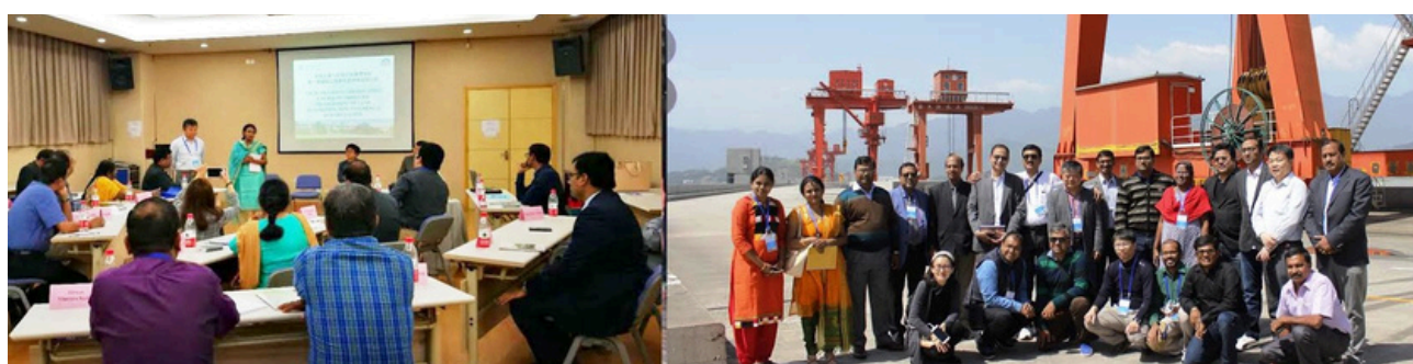
ASCI-NRCR Joint Certificate Course: Participants at Site of World's Largest Hydro-project- The Three Gorges Project, China (Held Annually 2017-18 to 2019-20)