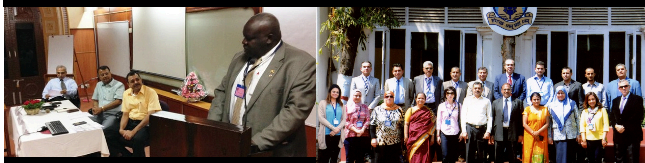
Mr. Aidah Nantaba, Hon'ble Minister of State for Lands, Govt. of Uganda at ASCI in May 2015