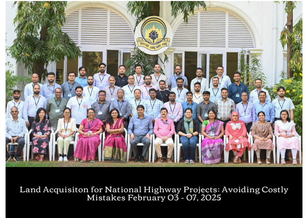
Land Acquisition for National Highway Projects: Avoiding Costly Mistakes February 03 - 07, 2025