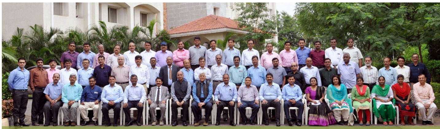
National Conference on Land Acquisition for Infrastructure Projects, August, 16-17, 2017