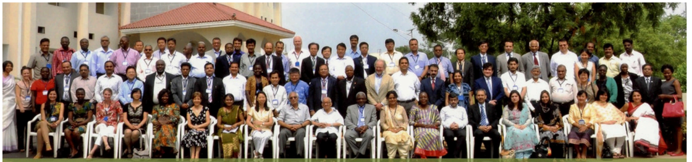
International Conference on R & R and Benefit Sharing, May 20-24, 2013