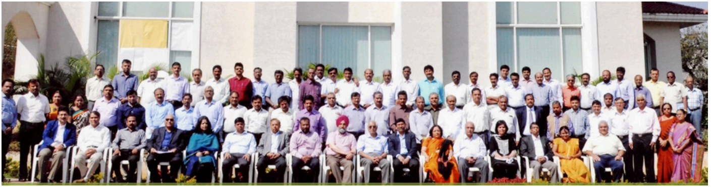
National Conference on RFCTLARR Act, 2013, February 17-18, 2014

"LET US BE TOGETHER. LET US INTERACT TOGETHER. AND MAY OUR MINDS COMPREHEND TOGETHER"