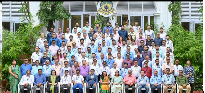
October 2024 109 Nominations