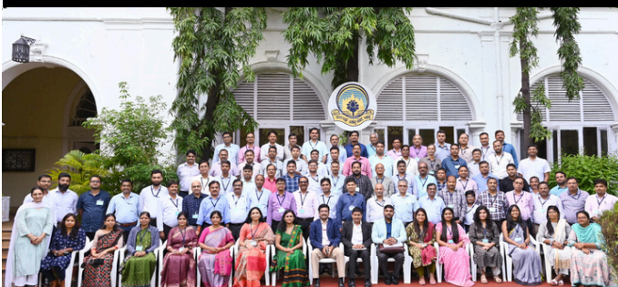
October 2022 105 Nominations